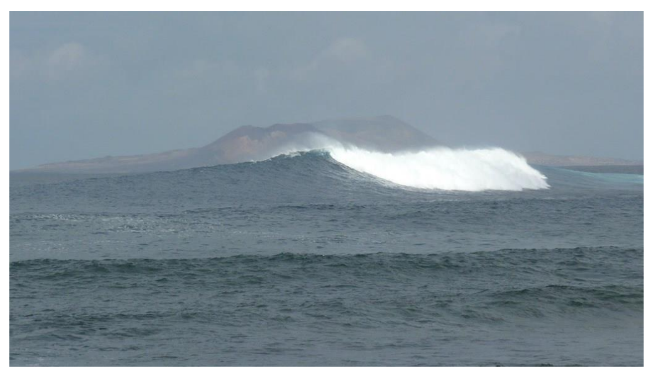
Waves off the north coast of Lanzarote